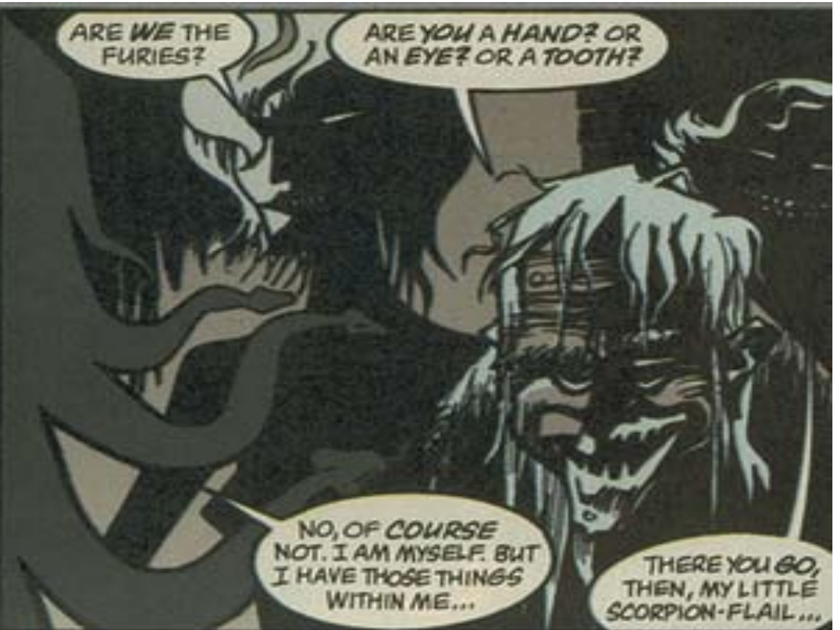
The Sandman Vol. 9, "The Kindly Ones"