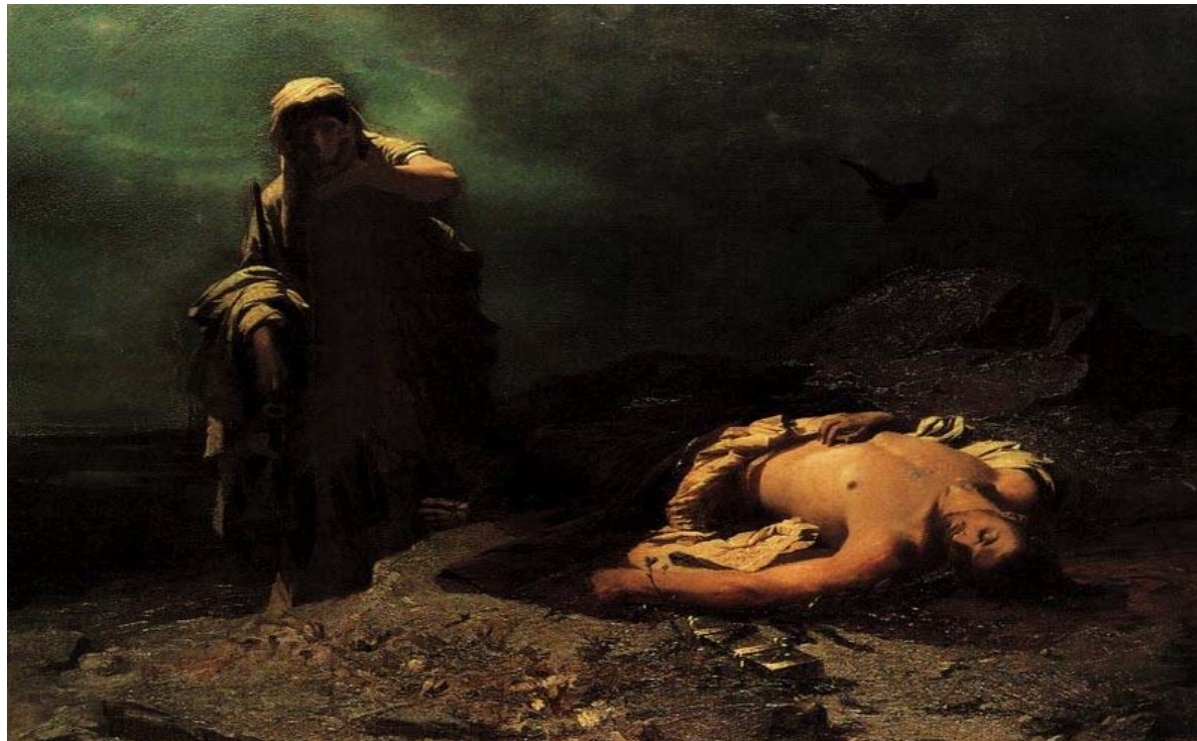
Antigone in front of the dead Polynices, Nikiphoros Lytras

Antigone: “I don’t care. He is our brother. He must be buried. Otherwise, his soul will wander the Earth forever, never being allowed to pass on. He would curse our family.”