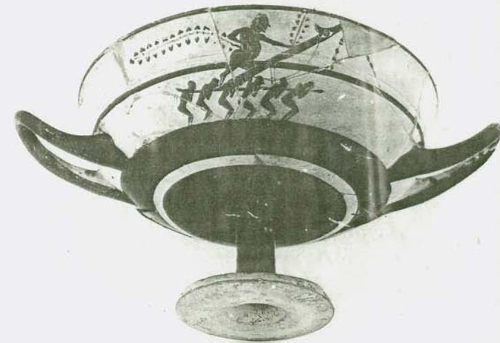
Plate 19B. II 4B.